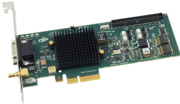
With full height bracket

The FireBird Single CXP-6 Low Profile can be purchased with either a full height PC card bracket for use in regular PCs or with a low profile PC card bracket to fit into small embedded PC enclosures and 2U rack mount cases.