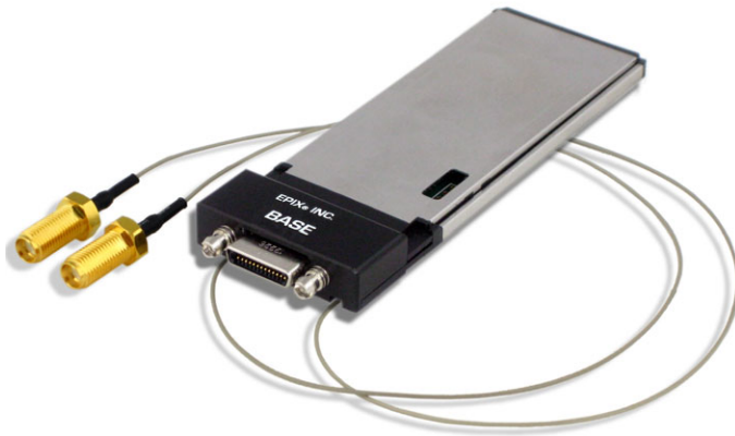
PIXCI® ECB1-34 ExpressCard frame grabber with SDR (mini) Camera Link connector measures 99mm L x 34mm W. Trigger input and strobe output cables, with SMA connectors, are optional.